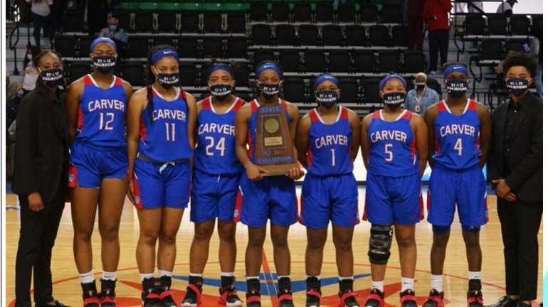
Carver High School Girls Basketball Team after winning 5A state championship (AHSAA)

Congrats again to the Carver High School Lady Rams!